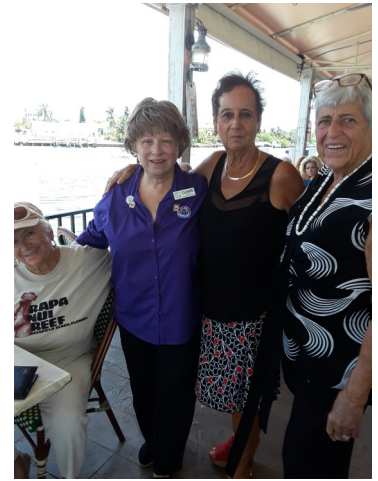
June Luncheon at Two Georges