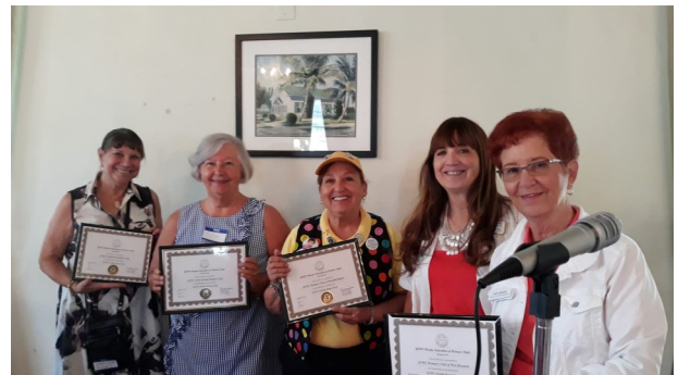
Clubs receiving Honor Score Certificates