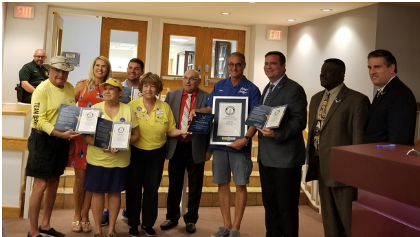
Proclamation Award from City of Deerfield